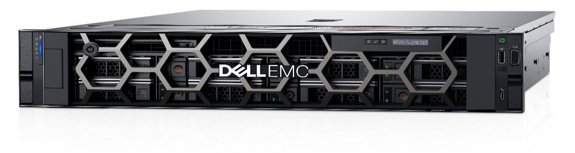
Fig 0.1: R7525 server

o Broadcom 57414 Dual Port 10/25GbE SFP28, OCP NIC 3.0