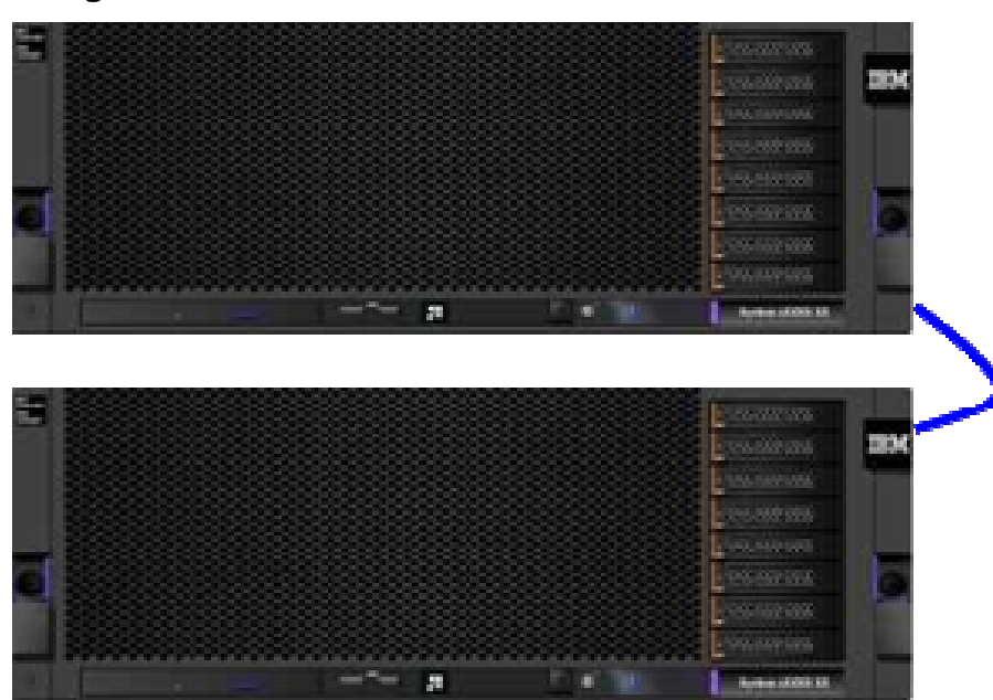
IBM System 8S x3850 X5 with QPI scaling

The \ measured \ and \ priced \ configurations \ are \ the \ same. \ For \ the \ priced \ configuration, see \ the \ Executive \ Summary.