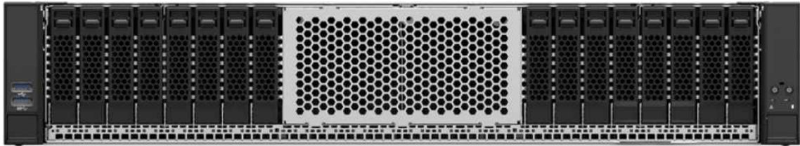
Figure 0.1: Benchmarked and Priced Configuration