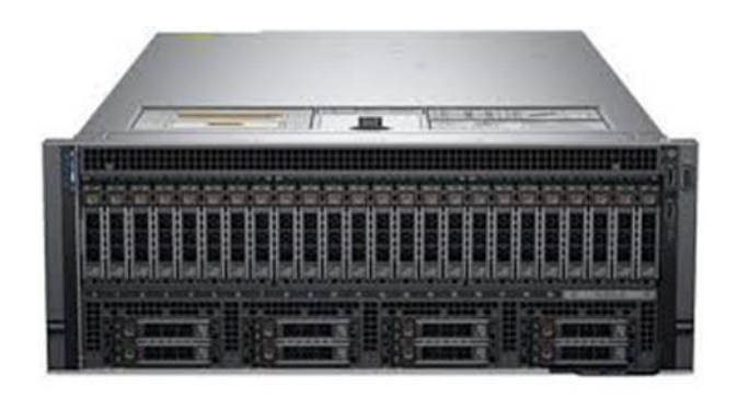
Figure 0.1 Benchmark and priced configuration for PowerEdge R940xa server

Note—There were no differences between the tested and priced configurations.