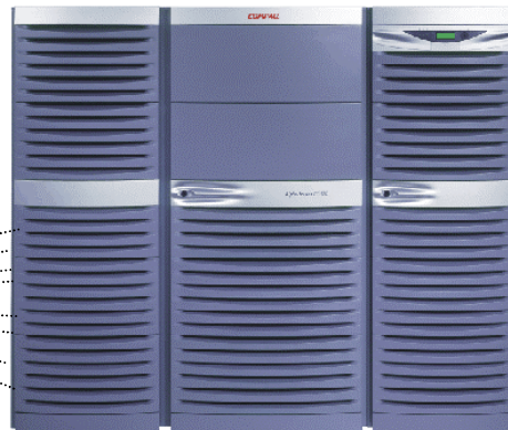
Compaq AlphaServer GS320 Model 6/731- 32 CPU 128GB

133 Ethernet Segments on 10/100 Mbps Fast Ethernet 1,016 Users per Segment Total PC's – 135,040